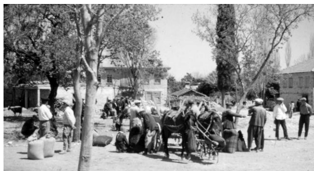
Çakırlar in the 1960s

The larger villages of the group lie mostly in the alluvial plain fed by three rivers which join together before entering the sea nearby. The alluvium permits profitable irrigated farming, including extensive orchards, while the agriculturally poorer settlements further up into the valley traditionally emphasised animal husbandry. All the villages and hamlets in the valley grew markedly in population size through the twentieth century, particularly after the eradication of malaria by the 1950s. Many people speak of their origins as nomads ( yürük ) and talk of their predecessors moving down from their mountain pastures ( yayla ) in the Taurus Mountains to the north and west. Prior to the 1960s the villages of the group were relatively remote from Antalya city because road communications were poor and vulnerable to flooding – as, quite seriously, in the winter of 1960-61. Barter