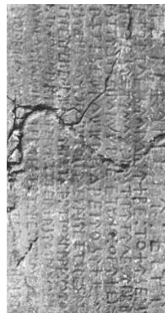
Fig 6 – a section

same family as Luwian and (so-called) Hittite – the understanding of its grammar and lexicon is inadequate. Even the tri-lingual inscription, Lycian, Greek and Aramaic, discovered in 1973 at the Letoön sanctuary, added little. Even so, names and places can sometimes be read. The transcription, found in the aforesaid volume in the British Library, yields the name Ikuwe (line 1), who was certainly the owner of the tomb, and a place name, Wazzis, the location of which is not known. The name Arttumpara can be recognised (line 7) and Alakssañtra (line 9) which is known to be the Lycian version of Alexander. Arttumpara is a name found in a number of other contexts and he was possibly a local or regional ruler, extant 380-360 BCE. Some authorities believe that the Alexander referred to was no less than Alexander the Great. If that is so, the close association on the stone of Arttumpara and Alexander, separated in time by at least a generation, does not help us interpret the inscription. As we said earlier, the stone must have been part of a larger structure but there are no other elements of it to be seen. To the side of the stone there is a sharp drop down to a stream and there might be traces down there. On the other hand, the road builders might have rejoiced at finding a source of hard core. As we leave Tlos, it is with a quiet prayer that when the road needs widening or re-surfacing, which it will inevitably, the road builders keep their hands off the big black stone.